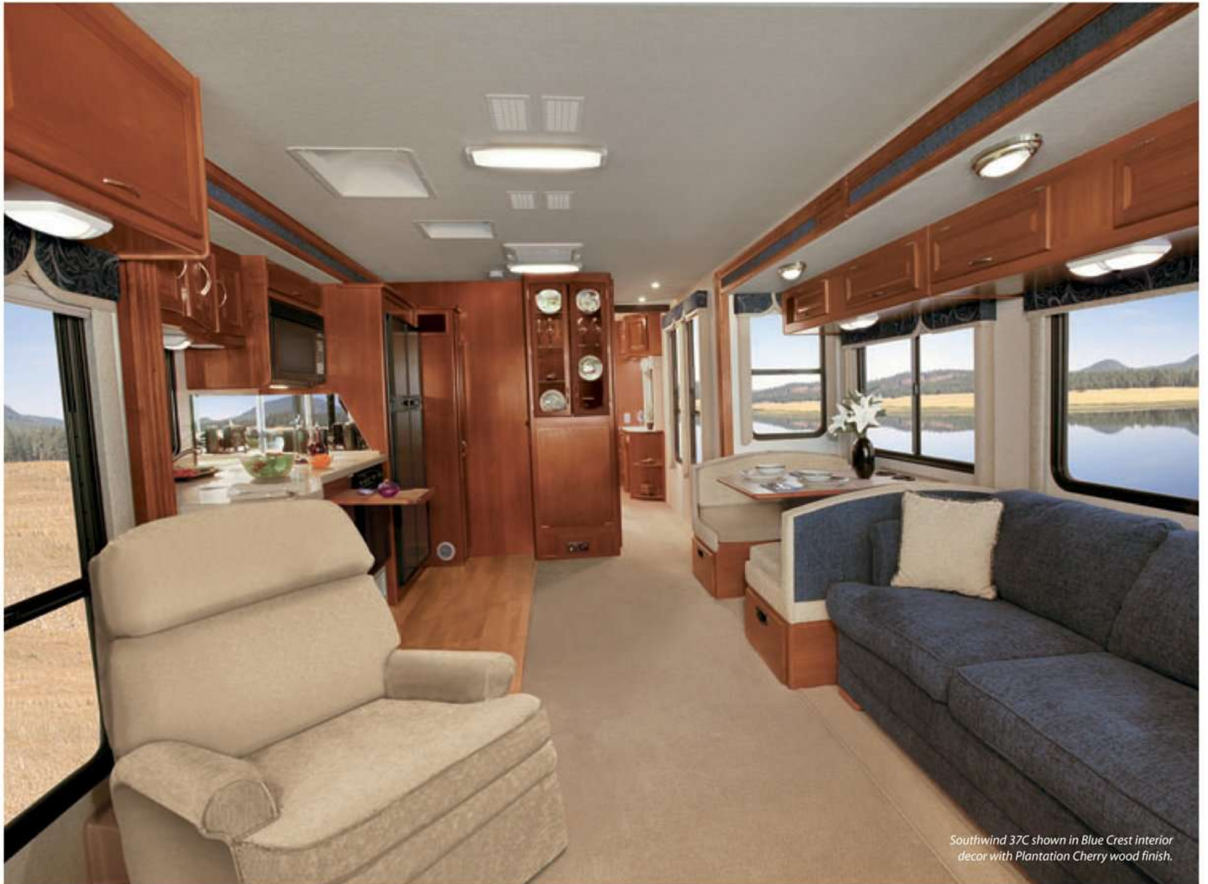
Southwind 37C shown in Blue Crest interior decor with Plantation Cherry wood finish.