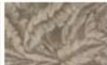
Dinette Cushions & Throw Pillow