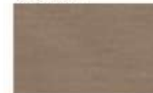
Bedspread & Pillow Shams