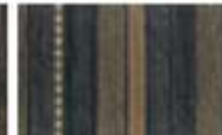
Dinette Cushions & Throw Pillow