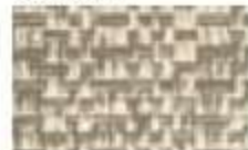
Bedspread & Pillow Shams