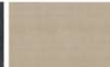
Ultraleather™ Driver/ Front Passenger Seat