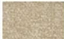
Dinette Cushions & Throw Pillow