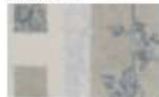
Bedspread & Pillow Shams