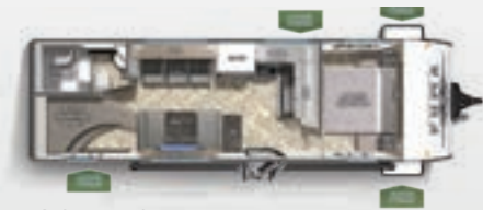
23 BHC ●