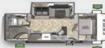
27 RBQC ●