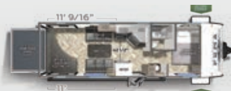
25 TFC ●