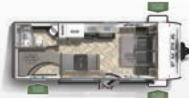
20 MBC ●