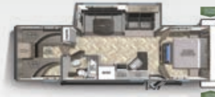
30 DBSC ●●