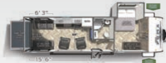
27 TSB ●