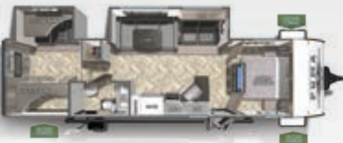
31 BHSC ●●