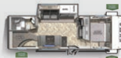
25 BHSC ●