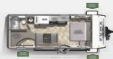
22 RBC ●