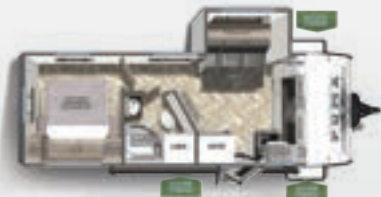
22 FKC ●