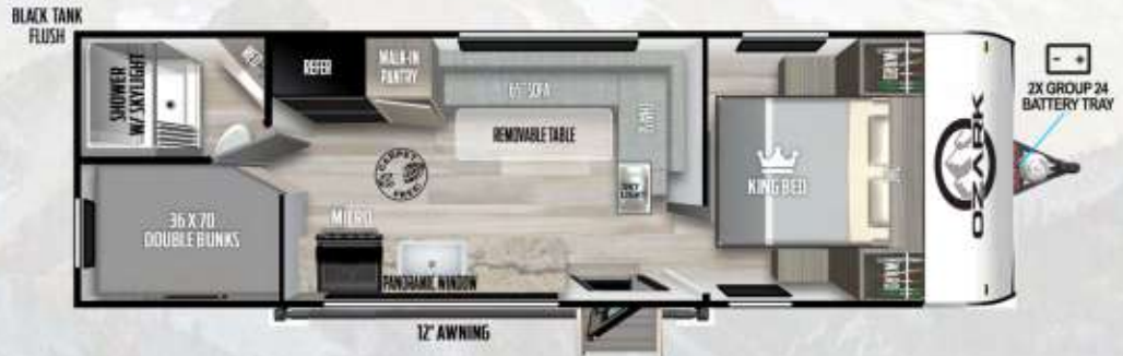
2400BHL LENGTH: 29' 4" UVW: TBD