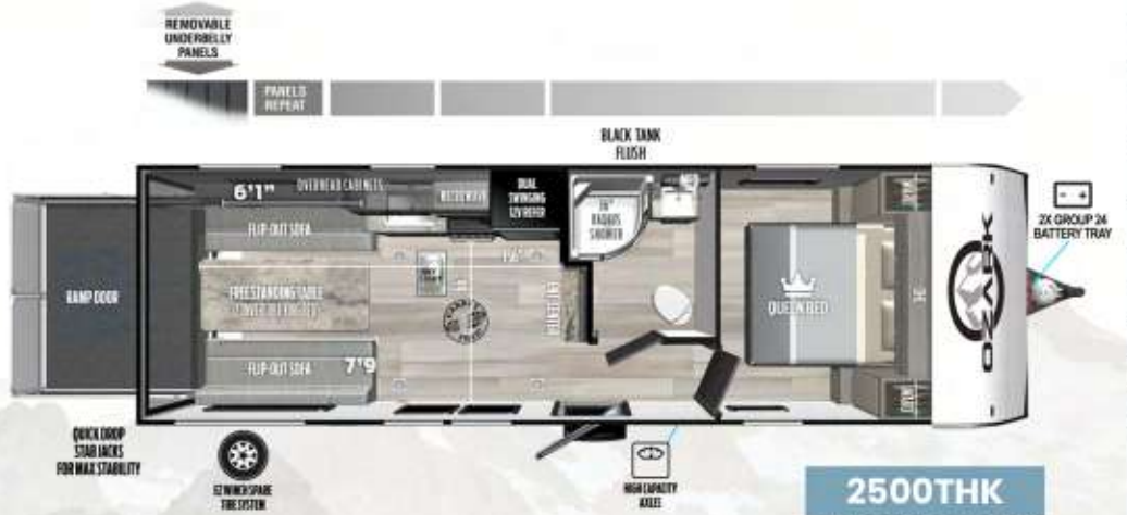
2500THK LENGTH: 28' 8" UVW: 4913 LBS