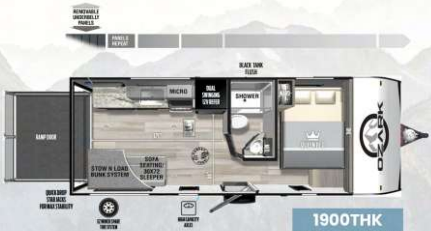
1900THK LENGTH: 23' 5" UVW: 4359 LBS