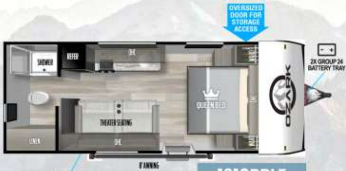
1610RBL LENGTH: 20' 1" UVW: 2889 LBS