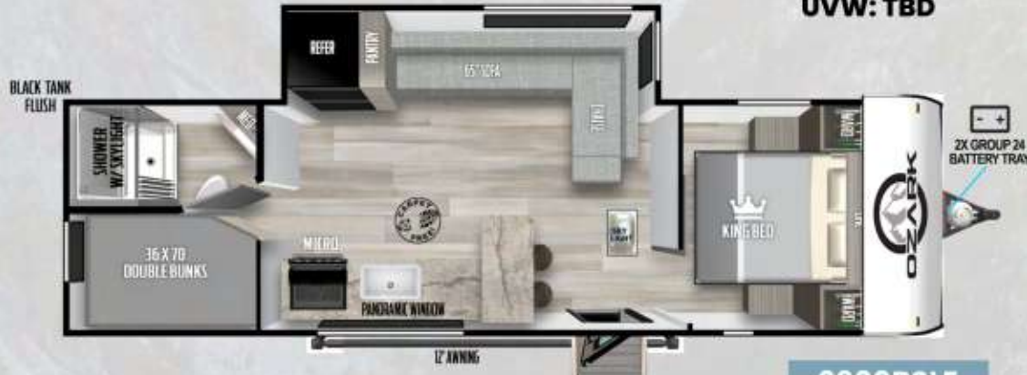
2600BSL LENGTH: 32' 7" UVW: TBD