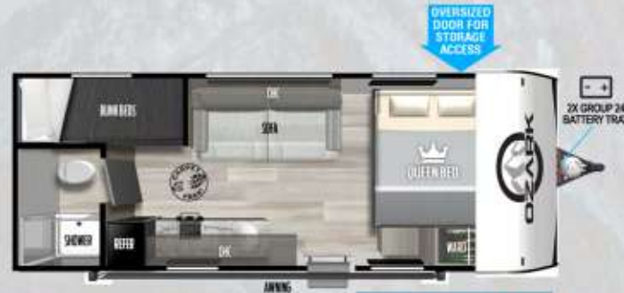
1620BHL LENGTH: 20' 1" UVW: 2809 LBS