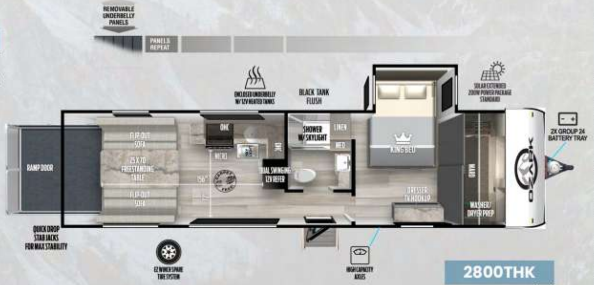
2800THK LENGTH: 33' 7" UVW: 7188 LBS