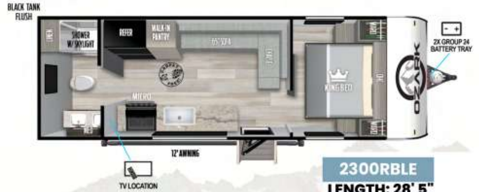
2300RBL LENGTH: 28' 5" UVW: TBD